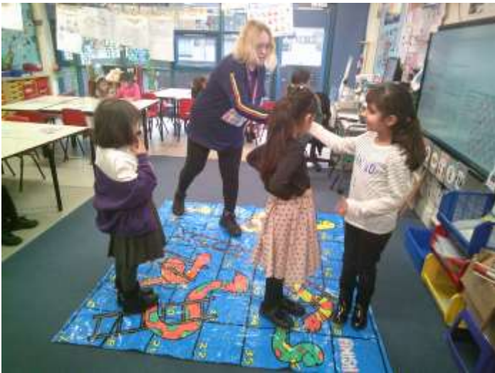
Beech Class enjoyed playing Snakes and Ladders on Number Day