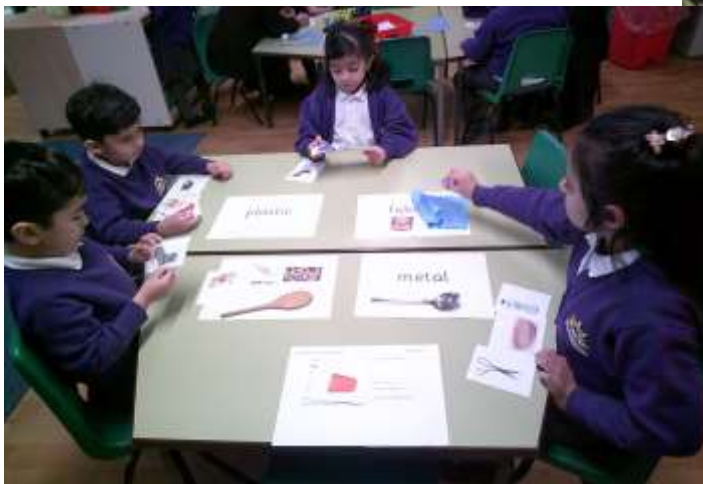
Poppy Class enjoyed learning about different materials