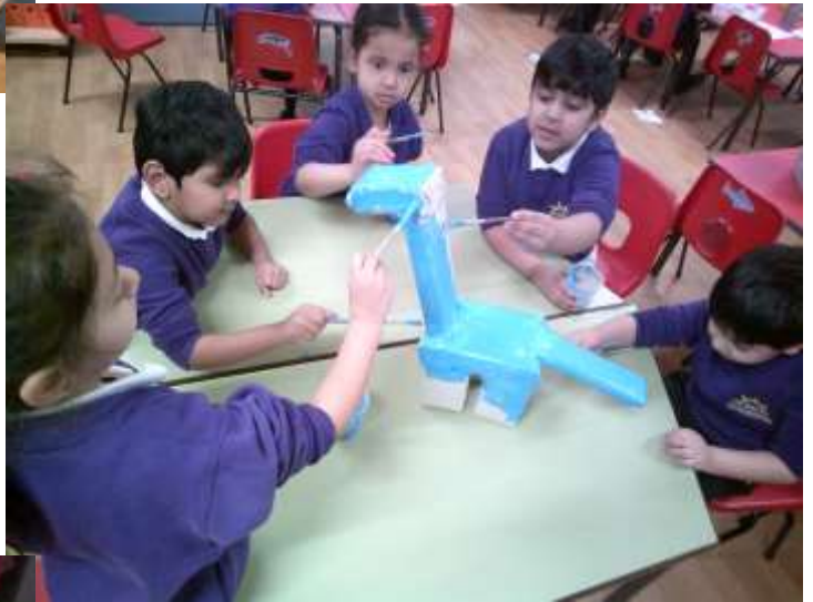
Daisy Class enjoyed creating our own 3D dinosaurs!