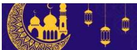
Willow Class loved having their parents join us for Eid!