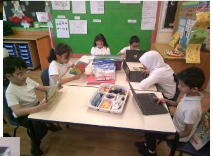
In Kingfisher Class, we are studying different artists. We looked at the work of environmental artist Andy Goldsworthy and felt inspired to create our own pieces from nature