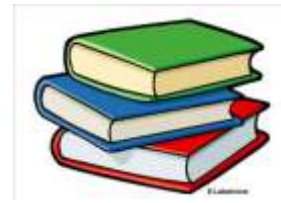
Lark Class enjoyed choosing a book from the Pop-Up book shop on World Book Day!