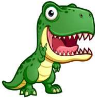
Snowdrop Class had fun learning all about dinosaurs and used junk modelling to make their own dinosaur models!