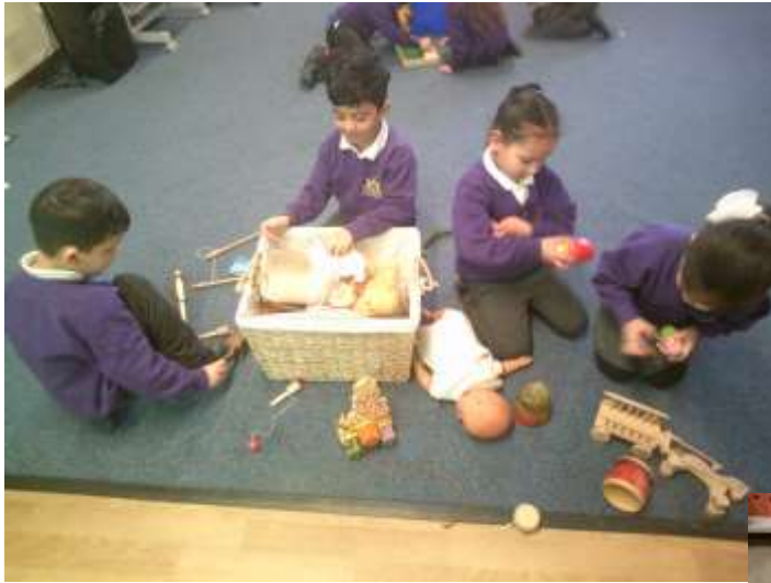
Buttercup Class have enjoyed learning about toys from the past