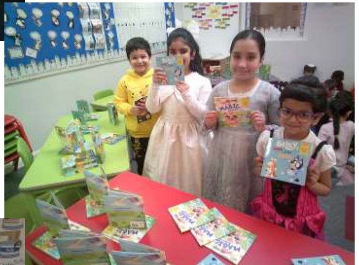
In RE, Pine Class have been learning how to connect different faiths