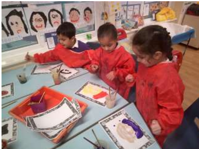
Buttercup Class had fun painting pictures of ourselves wearing our uniform when learning about ourselves.