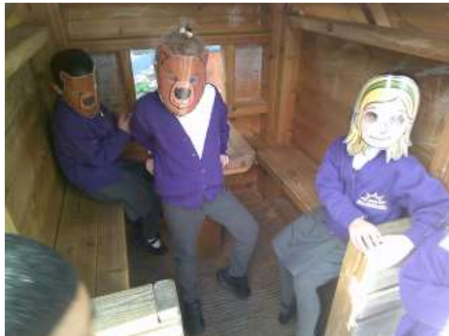
Daisy Class enjoyed retelling the story of Goldilocks and the Three Bears.