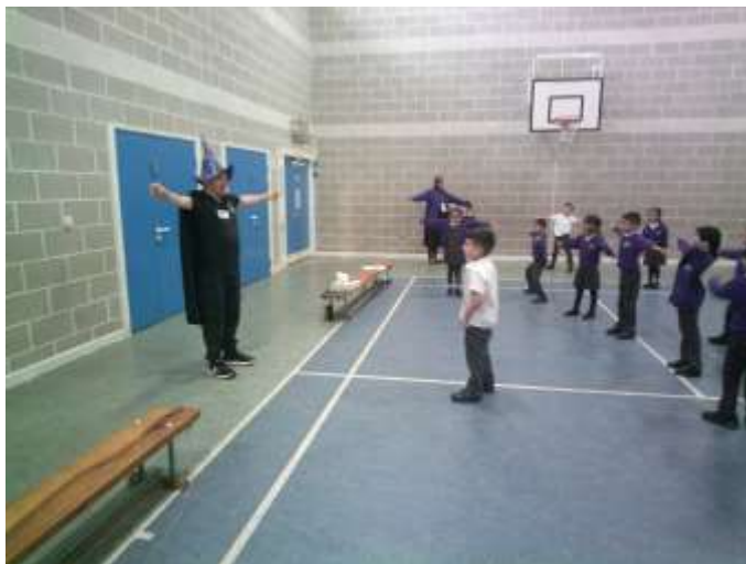
Oak Class enjoyed performing a story