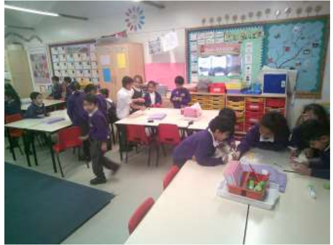
Beech Class have enjoyed making posters for the different types of weather