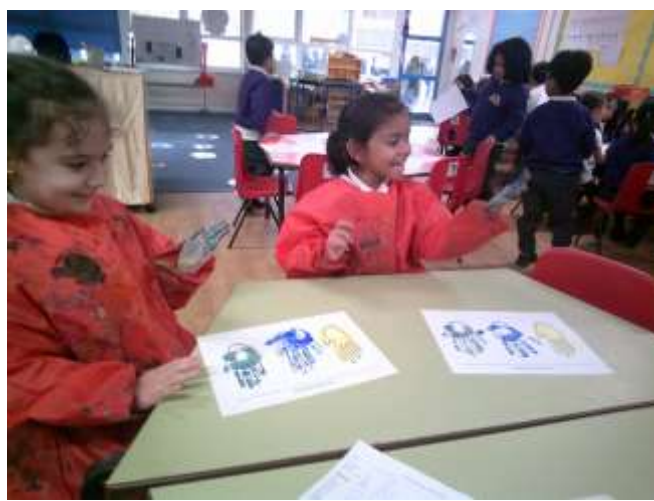
Snowdrop Class enjoyed colour mixing with a friend!