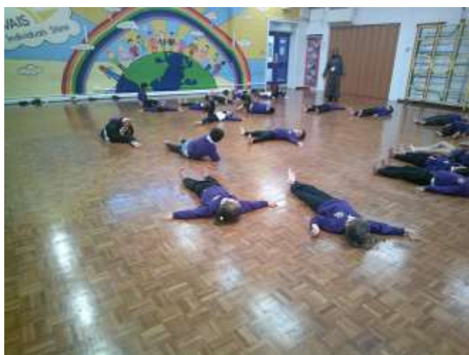
Poppy Class like making different shapes with their bodies in Gymnastics!