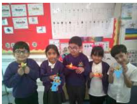
The children really enjoyed having their grown-ups join them in school for their Diwali workshops. The children created paintings and models of fireworks as Diwali is known as the Festival of Lights!