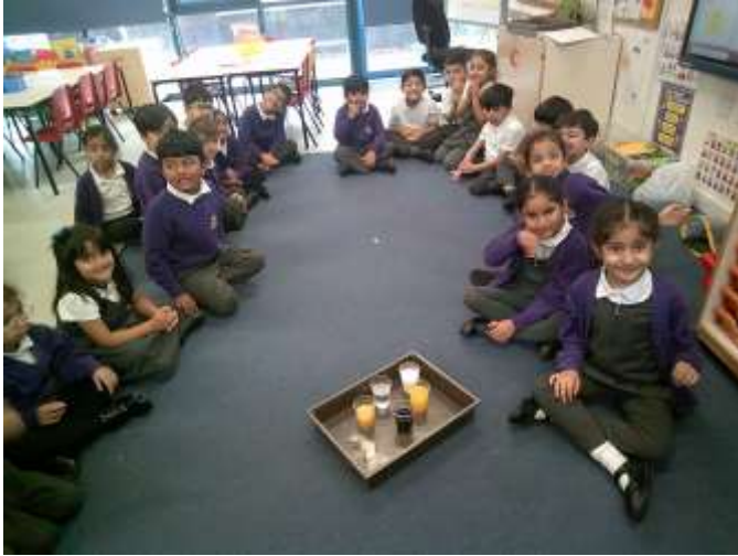
Pine Class enjoyed learning about how to keep their teeth healthy