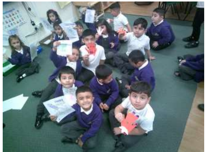
Willow Class were interested to learn all about Diwali